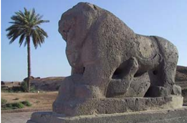
This one is literally called The Lion of Babylon

Ishtar-Gate was the eighth gate to the inner city of Babylon. It was constructed in about 575 BC by order of King Nebuchadnezzar II on the north side of the city and dedicated to the Babylonian goddess Ishtar