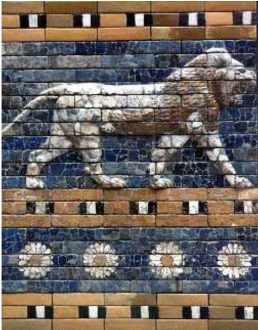
Picture of goddess Istar, Ishtar-Gate, Babylon

Ishtar-Gate was the eighth gate to the inner city of Babylon. It was constructed in about 575 BC by order of King Nebuchadnezzar II on the north side of the city and dedicated to the Babylonian goddess Ishtar